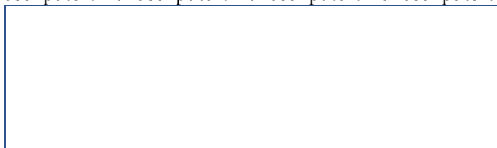
Figure 1. Title of the figure

Manuscript text manuscript text manuscript text manuscript text manuscript text manuscript text manuscript text manuscript text manuscript text manuscript text manuscript text manuscript text.